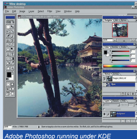
Adobe Photoshop running under KDE