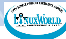
Voted best desktop office solution by LinuxWorld!